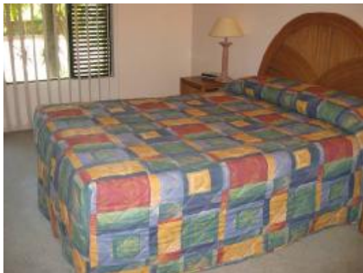
Queen bed configuration

All the switches are located 1100mm from the floor in easily accessible locations.