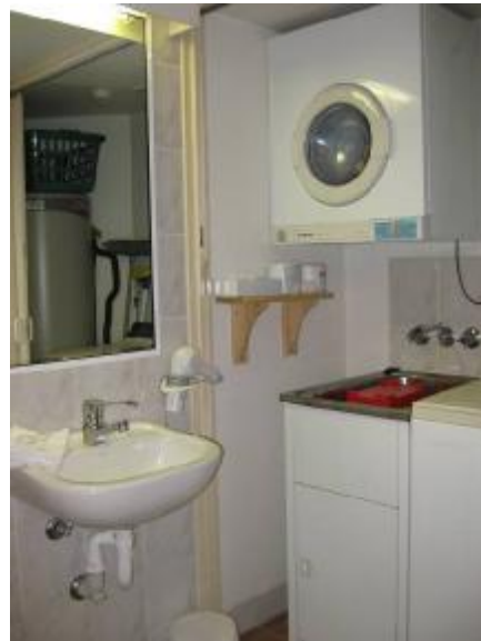
Sink and laundry