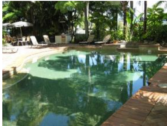
Pool area, combo lock makes for easy access