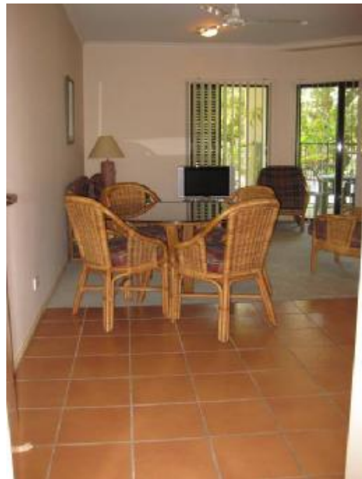
Main lounge configuration