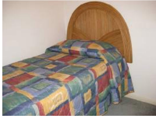
Single bed configuration in second room