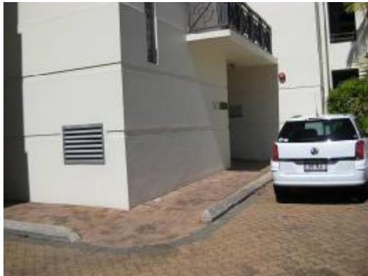
Access to Reception

There is no lowered counter but staff will assist if required. There is ample seating in reception if required.