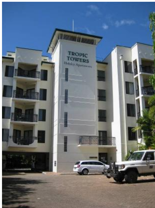
Tropic Towers Holiday Apartments

Room numbers: One accessible room no interconnecting rooms, kitchenette provided.