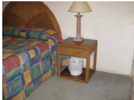
Side clearance in main bedroom